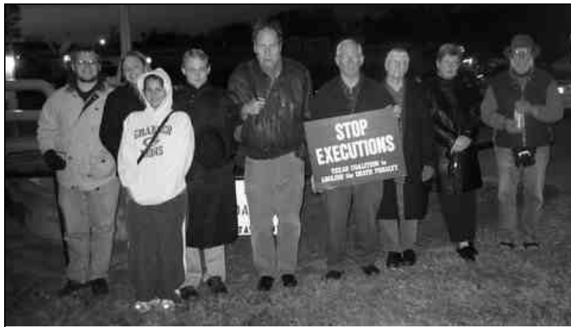
Vigil at the last Texas execution of 2009 - Bobby Wayne Woods - December 3, 2009 - Walls Unit in Huntsville, Texas.

Texas closes down its execution machinery as we get close to Christmas. Is this done out of deference to the Prince of Peace who taught us to forgive and show mercy? If there is anything that is antithetical to the message of Christ, it is the state-sponsored killing of another human being.